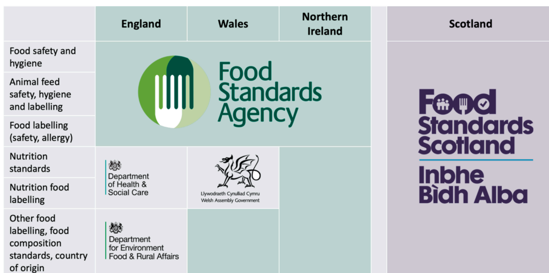
Fig. 2. FSA’s devolved responsibilities.